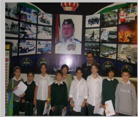
PUBLIC SECURITY DIRECTORATE